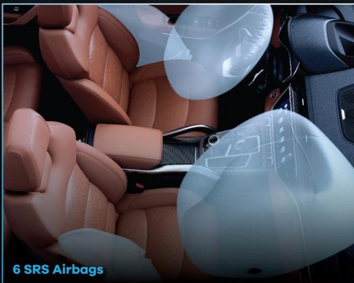
6 SRS Airbags

Safety is at a premium with the Azkarra. Knowing that you're safe makes you focus more on the refined ride.